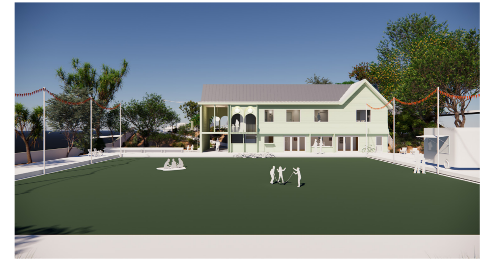
The Hataitai Bowling Club reimagined.

In the heart of the Hataitai community, a momentous celebration took place on 11 November 2023, marking not only a decade of unwavering dedication but also the exciting next stage of our redevelopment journey: fundraising. The Hataitai Community Recreation Trust, the custodian of the former Bowling Club, has embarked on a new adventure to transform this historic site into a vibrant place for the community.