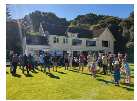
Redevelopment Launch Party

place will become a hive for gathering, recreation, learning, creating and connecting.