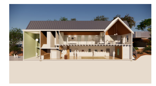
Architectural drawings showing the three main spaces

hosted a party where we discussed the history of the club and the future plans for it. The event was a vibrant reflection of our community's spirit and unity and featured live music and games on the green. This event wouldn't have been as successful without the support of local cafe Coolsville, contributing delectable catering and the Waitoa Social Club generously supplying their tasty beers. We were also delighted to continue our long partnership with Tommy's Real Estate, who helped us promote our cause.