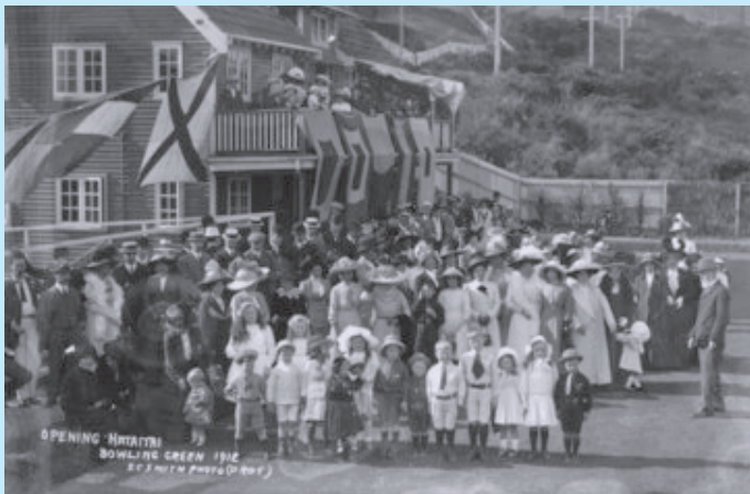
Group portrait taken at the opening of the Hataitai bowling green, Wellington.

There are some wonderful photographs, like this one showing the opening day of the Green in 1912, with a row of children in the foreground, all dressed in traditional Victorian clothing.