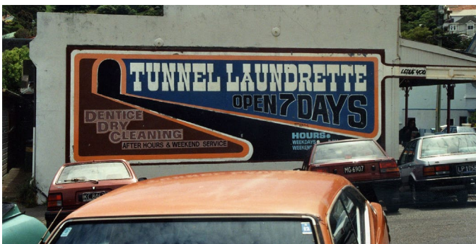
The laundrette wall in the 80's and the wall today.

Big Wash Tunnel Laundrette 23 Waitoa Road